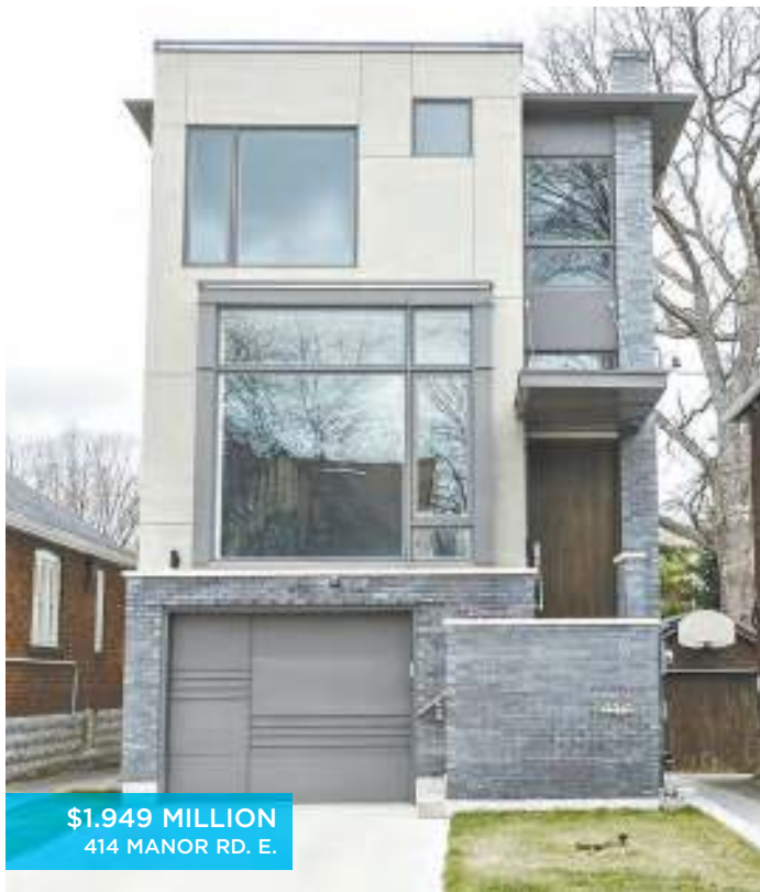
$1.949 MILLION 414 MANOR RD. E.