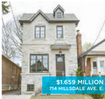
$1.659 MILLION 714 HILLSDALE AVE. E.